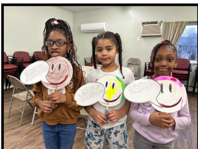
K-2 STUDENTS SHOW THEIR RESEARCH