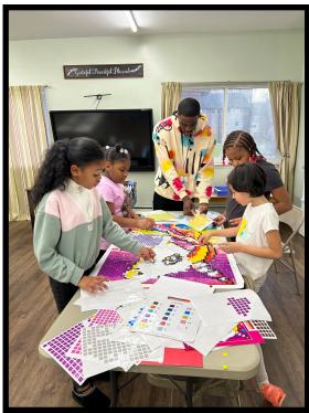
MOSAIC IN PROGRESS

The project fostered a spirit of cooperation and teamwork and the students enjoyed the reward of taking the blank canvas to completion.