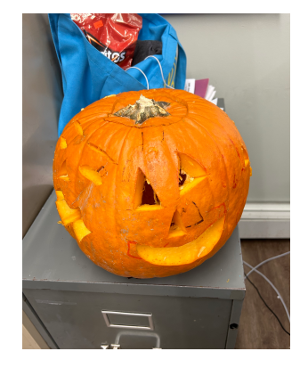
Gr. 3-5 made a 3 faced Jack O' Lantern creepy at any viewing

On Halloween, the students in each class, (K-2 and Gr. 3-5) carved a large pumpkin into a Jack O' Lantern. Then, to make their pumpkin face even scarier, the K-2 students painted it, and created a terrifying ghoul!