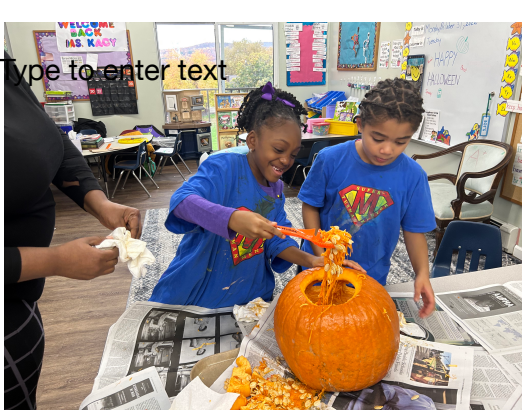
First, the K-2 students scooped out pumpkin seeds