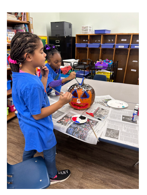
Finally K-2 painted their pumpkin to make it a scary pumpkin ghoul!!

WHAT'S HAPPENING IN THE UPCOMING MONTH NOVEMBER CLOSURES