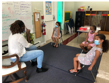
Community Circle Meetings